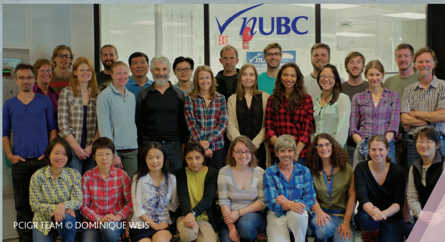
PCIGR TEAM