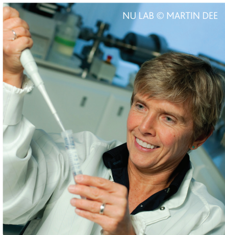
NU LAB